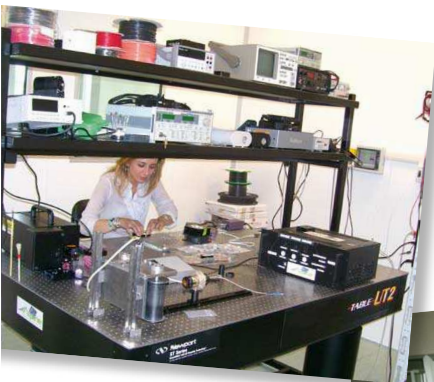
Fiber-optic and laser lab